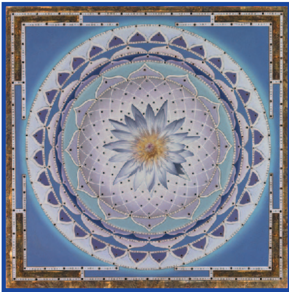
White Lotus Mandala

© 2009 Paul Heussenstamm. Used by permission. www.mandalas.com